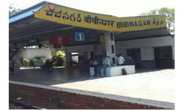
Bibinagar Railway Station